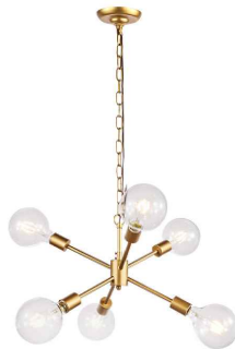
Brass Item No:LD5034D16BR