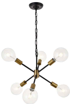
Brass&Black Item No:LD5033D16BRB